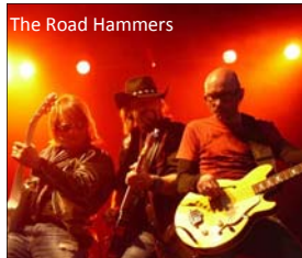
The Road Hammers

With a population of approximately 4,200, Grande Cache has over 440 hotel rooms and suites, a full service Municipal Campground, and 6 regional campgrounds in the area.