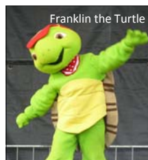
Franklin the Turtle