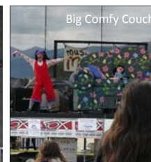
Big Comfy Couch