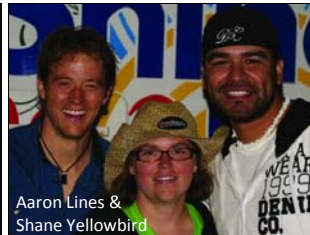
Aaron Lines & Shane Yellowbird